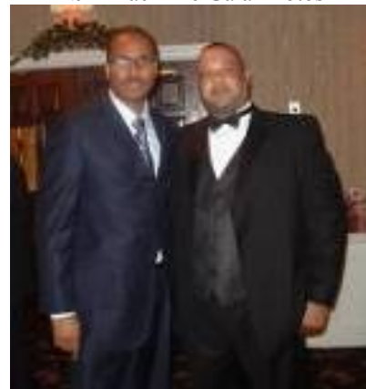
NJ - Black Tie Gala Photos