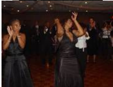
AABE December Board Meeting Photos