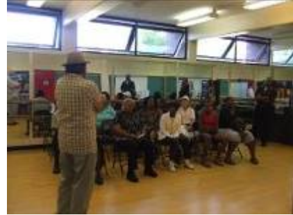
Western Regional Conference Photos